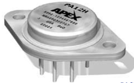
8-PIN TO-3 PACKAGE STYLE CE